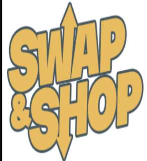
Swap & Shop