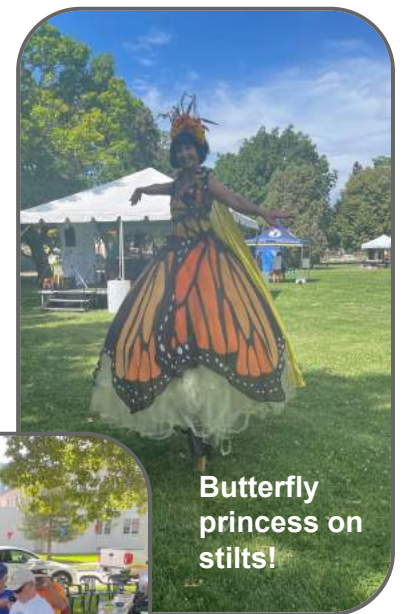
Butterfly princess on stilts!