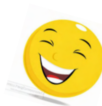
This is the editor's favorite

I took my suit to the cleaners, who wanted to charge me $15.00 So I gave my suit to the charity shop next door. They cleaned and pressed it and put it in the window. I bought it for $4.50!