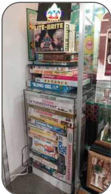
Recognize any of these?