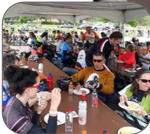
Left: Hungry riders Above: Hungry volunteers!