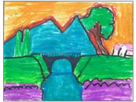
Hailey Snyder 8