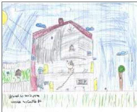
Davis Crowe 8