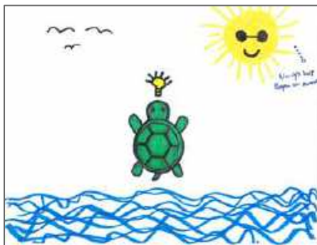
Tatum Dillon 10