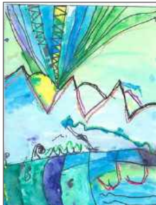
Logan Dillon 7