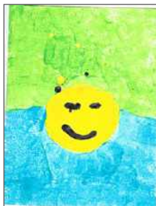
Noah Cussen 7