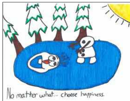
Leslie Dencklau 10