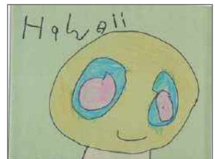
Jackson Fleury 6