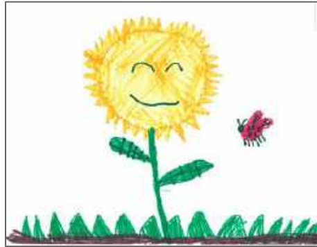
Trey Dencklau 8