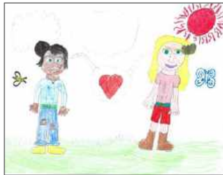
Erin Meredith 8 1/2